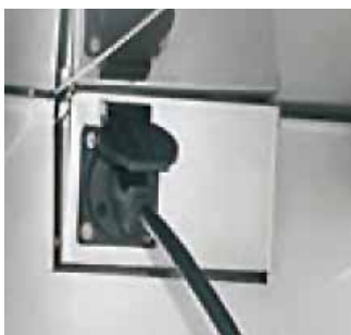
Heratherm Advanced Protocol incubators with internal socket for connection of electrical device (e.g. stirrer / shaker)