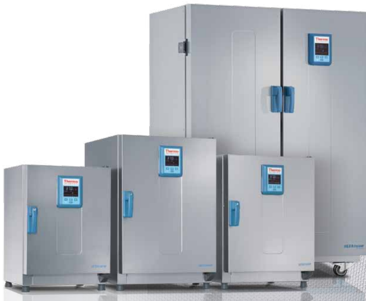
Heratherm Advanced Protocol Security microbiological incubators with stainless steel exterior

An optional stainless steel exterior is available for the Advanced Protocol Security models.