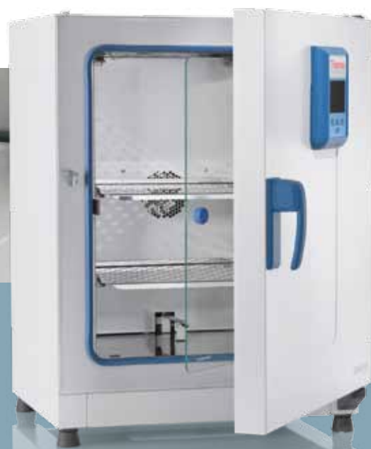
Heratherm Advanced Protocol microbiological incubator with unique dual convection, 180 L model pictured