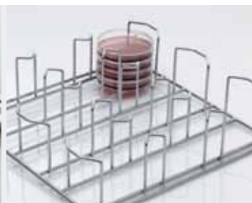
Petri dish holder