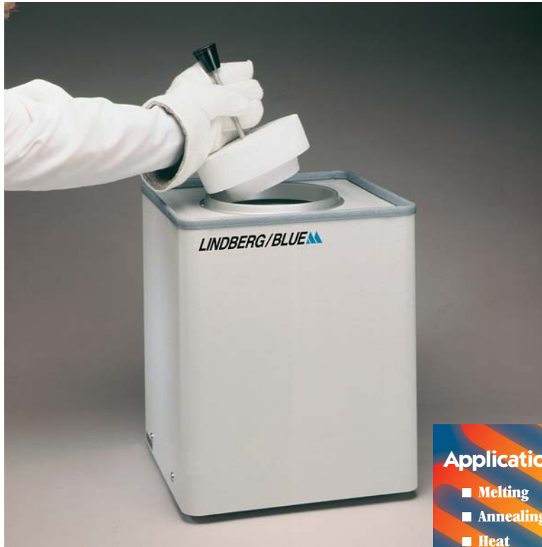
Model CF56622C Crucible Furnace.