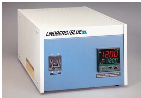
Model CC58114C Controller