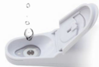
Accurate reading from only a single drop, in a few seconds