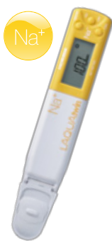
Sodium Ion Meter B-722