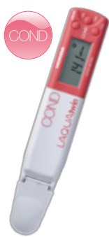
Conductivity(EC) Meter B-771