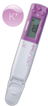
Potassium Ion Meter B-731