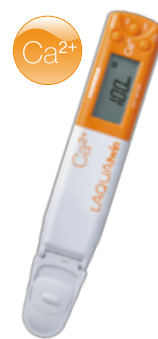
Calcium Ion Meter B-751