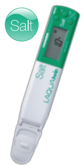
Salt Meter B-721