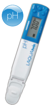
pH Meter B-713(US Only)