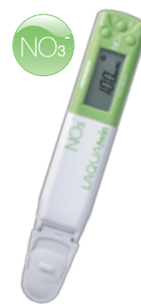
Nitrate Ion Meter B-741 (for crops) B-742 (for soil) B-743 (for general use)