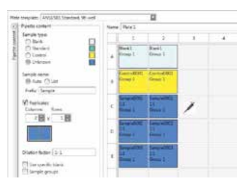
Figure 2. The innovative Virtual Pipetting Tool makes it easy to define samples in the plate layout.